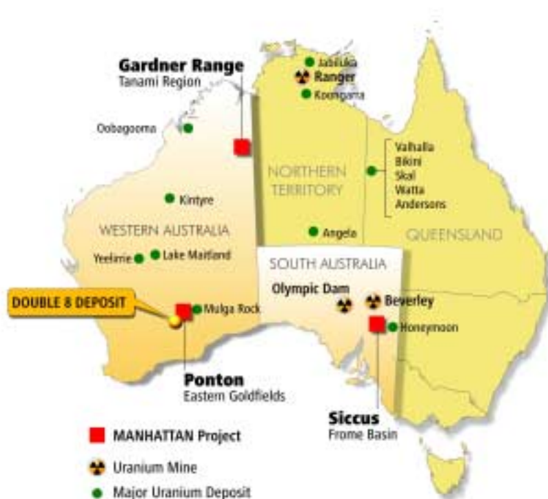
Figure 1: Manhattan's Australian Projects

Manhattan's strategy for growth is to advance its key uranium project at Ponton, expand and upgrade the confidence levels of the reported resource and advance the Double 8 uranium deposit to mine development stage. As well, by utilising the extensive database Manhattan has developed, target corporate opportunities identified to acquire quality uranium resources, that can be developed into producing mines in the near term, to grow the Company are also being pursued.