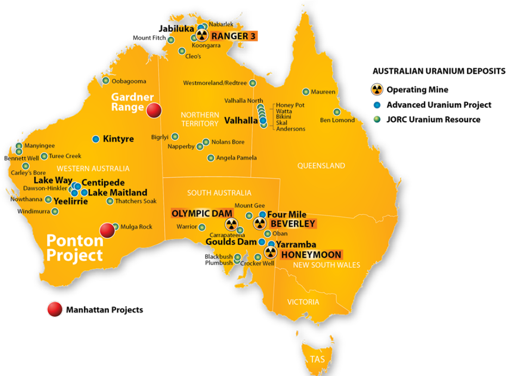
FIGURE 1: MANHATTAN'S PONTON URANIUM PROJECT

In March 2011 Manhattan reported an Inferred Resource for the Double 8 uranium deposit at Ponton in WA of 17.2 million pounds ("Mlb") of uranium oxide (" U_3O_8 ") at a 200ppm cutoff. This information was prepared and first disclosed under JORC Code 2004. It has not been updated since to comply with the JORC Code 2012 on the basis that the information has not materially changed since it was last reported.