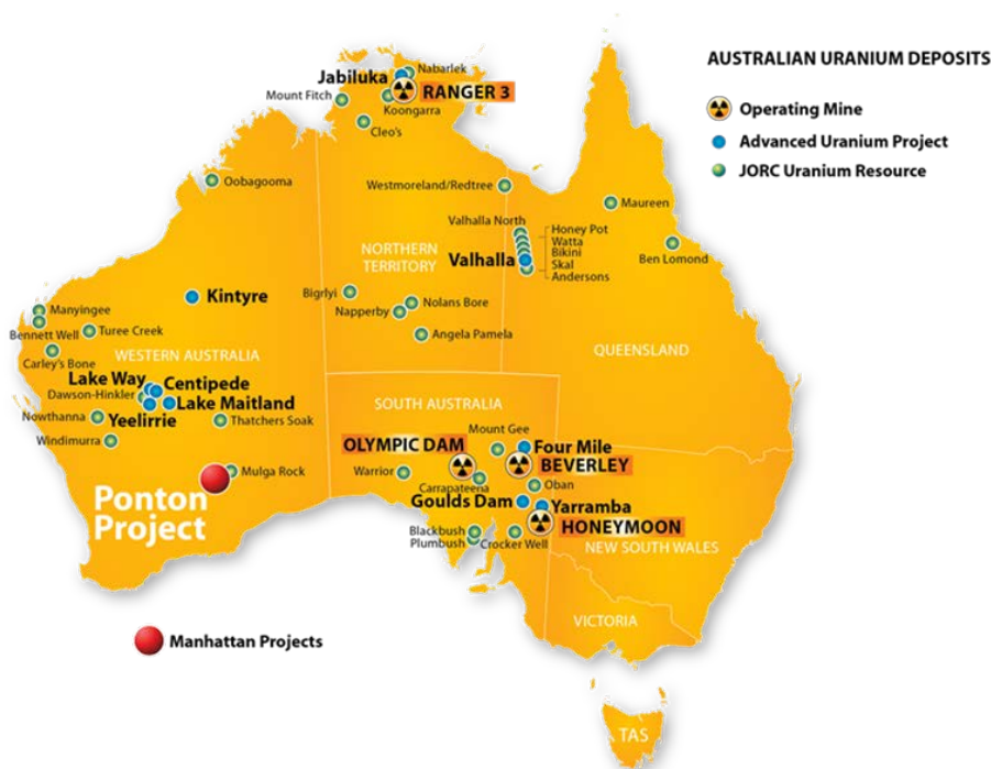
FIGURE 1: MANHATTAN'S PONTON URANIUM PROJECT

In March 2011 Manhattan reported an Inferred Resource for the Double 8 uranium deposit at Ponton in WA of 17.2 million pounds ("Mlb") of uranium oxide (" U_3O_8 ") at a 200ppm cutoff. This information was prepared and first disclosed under JORC Code 2004. It has not been updated since to comply with the JORC Code 2012 on the basis that the information has not materially changed since it was last reported.